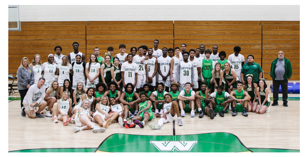
Members of 21-22 basketball teams, cheerleaders, and coaches

The 2021-22 basketball season began November 1st with a win for the Pioneers, defeating Dallas Premier Prep 100 -54. Full schedules and rosters can be found at pioneers.wosc.edu Members of Pioneer Pride organized "Meet the Pioneers" Thursday, November 4th to celebrate the teams and introduce the Pioneers! Pioneer Guy challenges the kids to a dance off and both the men and women teams competed in a three point competition.