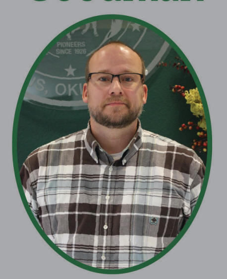
Physical Science and Physics Faculty